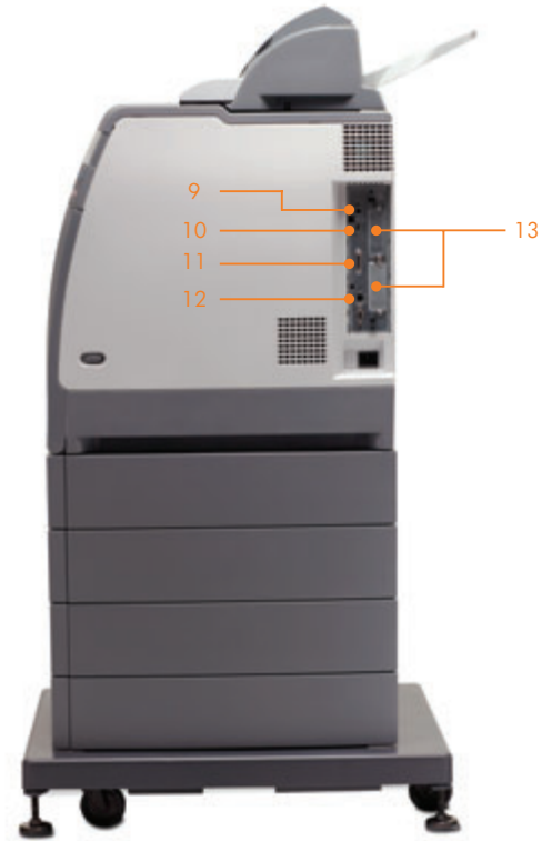
HP Color LaserJet 4700ph+ printer shown